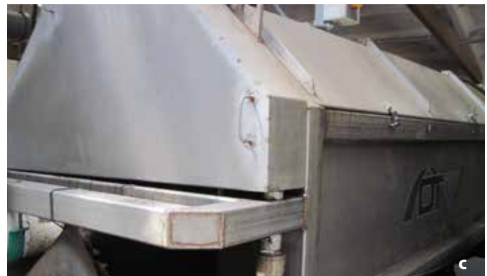
Figure 3. Separator types: a) Centrifuge, b) screw press, and c) rotating screen.

storage conditions are anaerobic, which will prevent nitrate from forming, thus reducing nitrous oxide emissions from liquid manure storage.