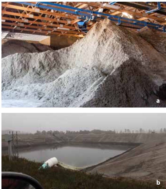
Figure 2. a) Separated solids, and b) separated liquids.